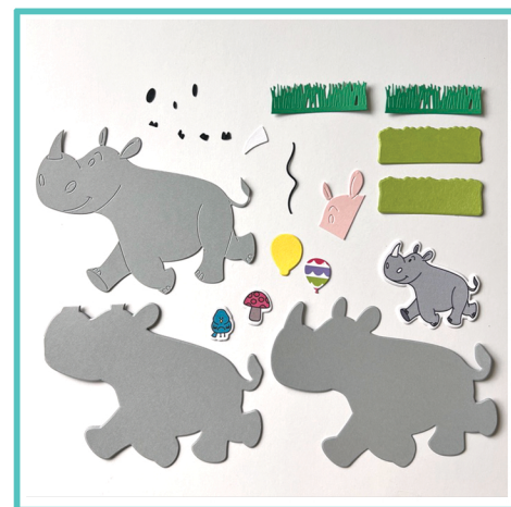
No adhesive sheets used