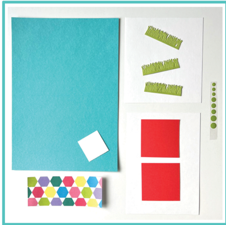
No adhesive sheets used on die cuts