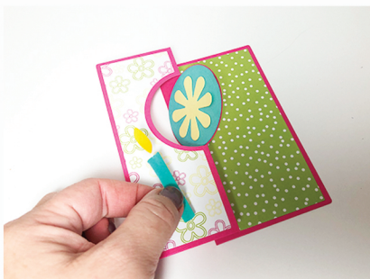
-Turn it to the left. The smaller side is always on the left.