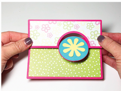
-Fold up the top flap on the score lines.