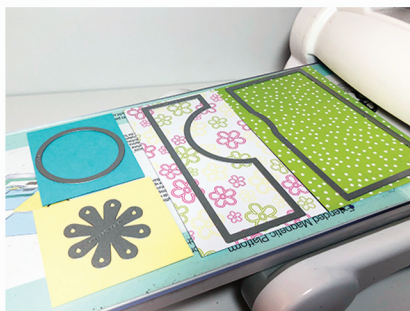
-Die cut layering pieces.