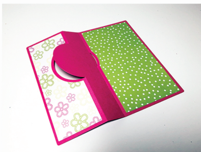
-Attach layering pieces.