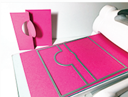
-Die cut card base.