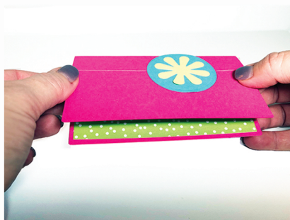
-Hold the Flip-its card with the larger part of the card base at the bottom and the smaller at the top. Fold it in half so the corners match up.